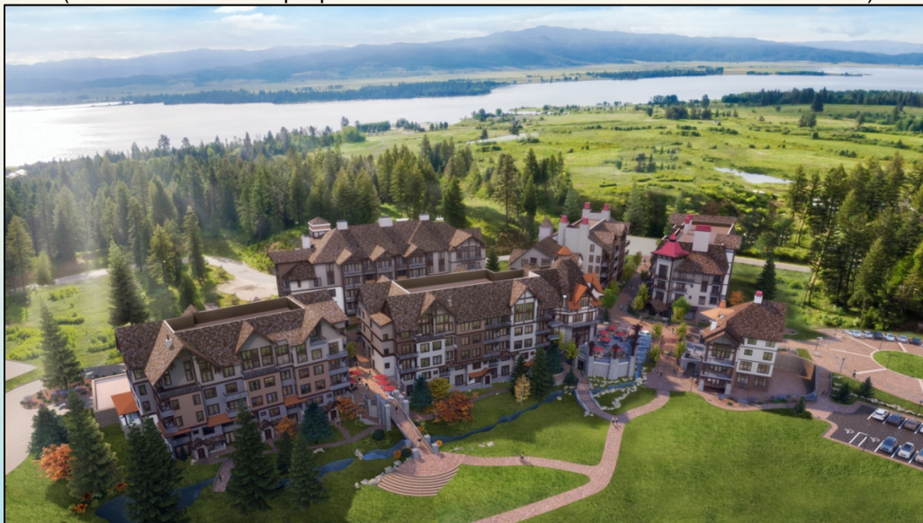
(Rendering of The Village at Tamarack, to be completed in 2021)